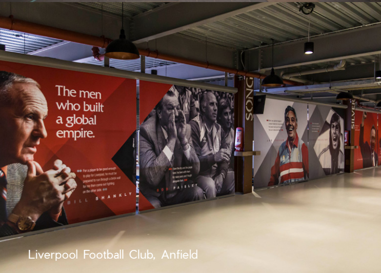
Liverpool Football Club, Anfield