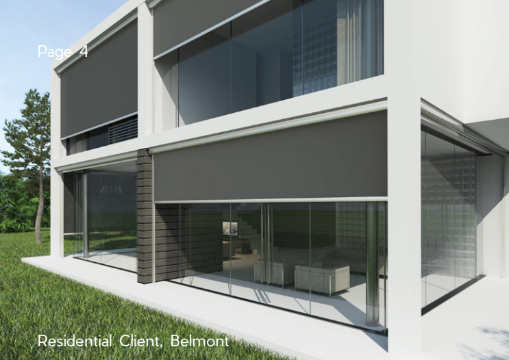
Residential Client, Belmont