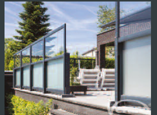
RETRACTABLE PARAPET GLASS