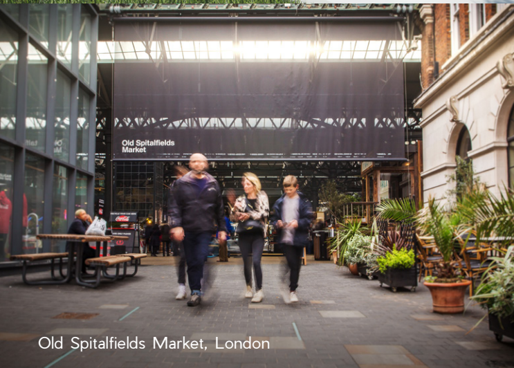
Old Spitalfields Market, London